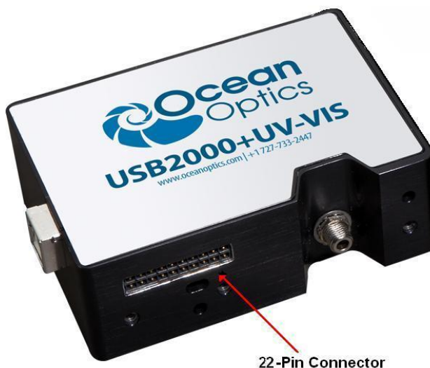
Location of USB2000+ Accessory Connector

The USB2000+ features a 22-pin Accessory Connector, located on the front of the unit as shown: