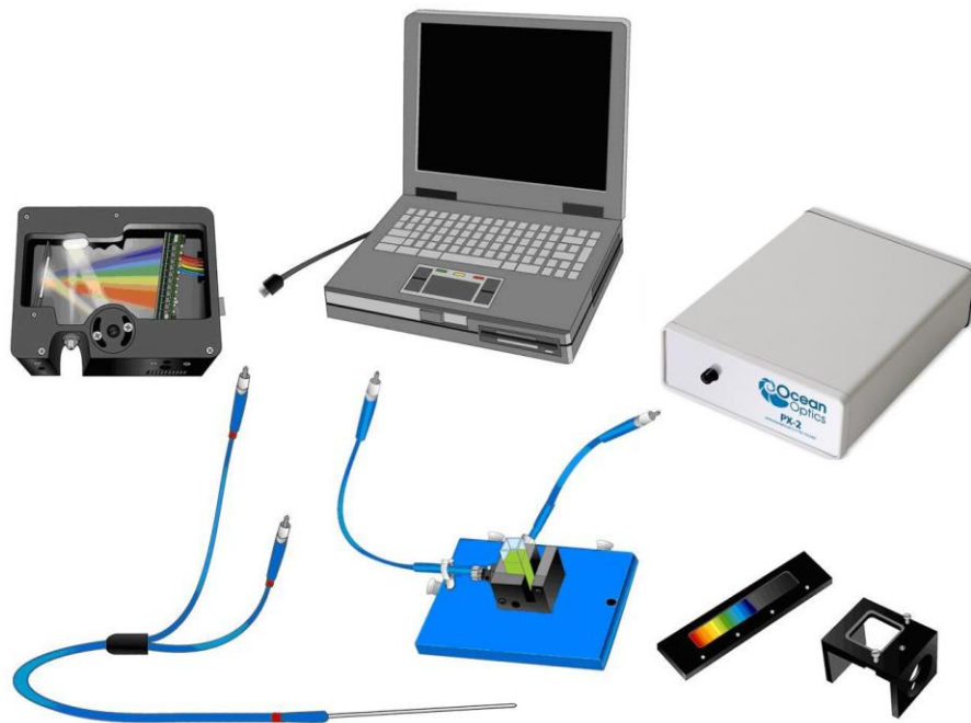
Ocean Optics USB2000+ Fiber Optic Spectrometer Typical Set-up

The USB2000+ Spectrometer connects to a computer via the USB port or serial port. When connected through a USB 2.0 or 1.1, the spectrometer draws power from the host computer, eliminating the need for an external power supply. The USB2000+, like all USB devices, can be controlled by our OceanView software, a Java-based spectroscopy software platform that operates on Windows, Macintosh and Linux operating systems.